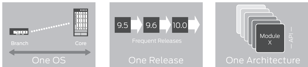
Figure 2: Junos OS utilizes a single source code, follows a predictable release train, and employs a modular architecture to ensure the consistent implementation of control-plane features across product lines.

In addition, each Juniper switch platform runs the same Junos OS, which ensures a consistent implementation and operation of each control plane feature across the entire Juniper product line.